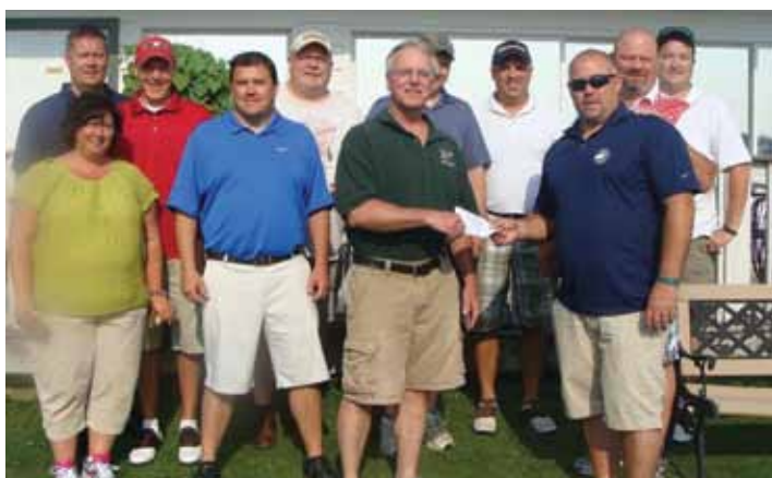
Class of 1986