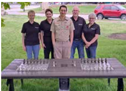
table has two built-in boards with chess pieces provided. Enjoy the view of the river while playing chess. This project was funded by donations from the George Family Foundation and Decorators.

Kevin Stout from the Eagle Scout Troop 320 built and donated a Chess Board Picnic Table for the community to use. It is located on Blackhawk Ave. at Lucky Park. This